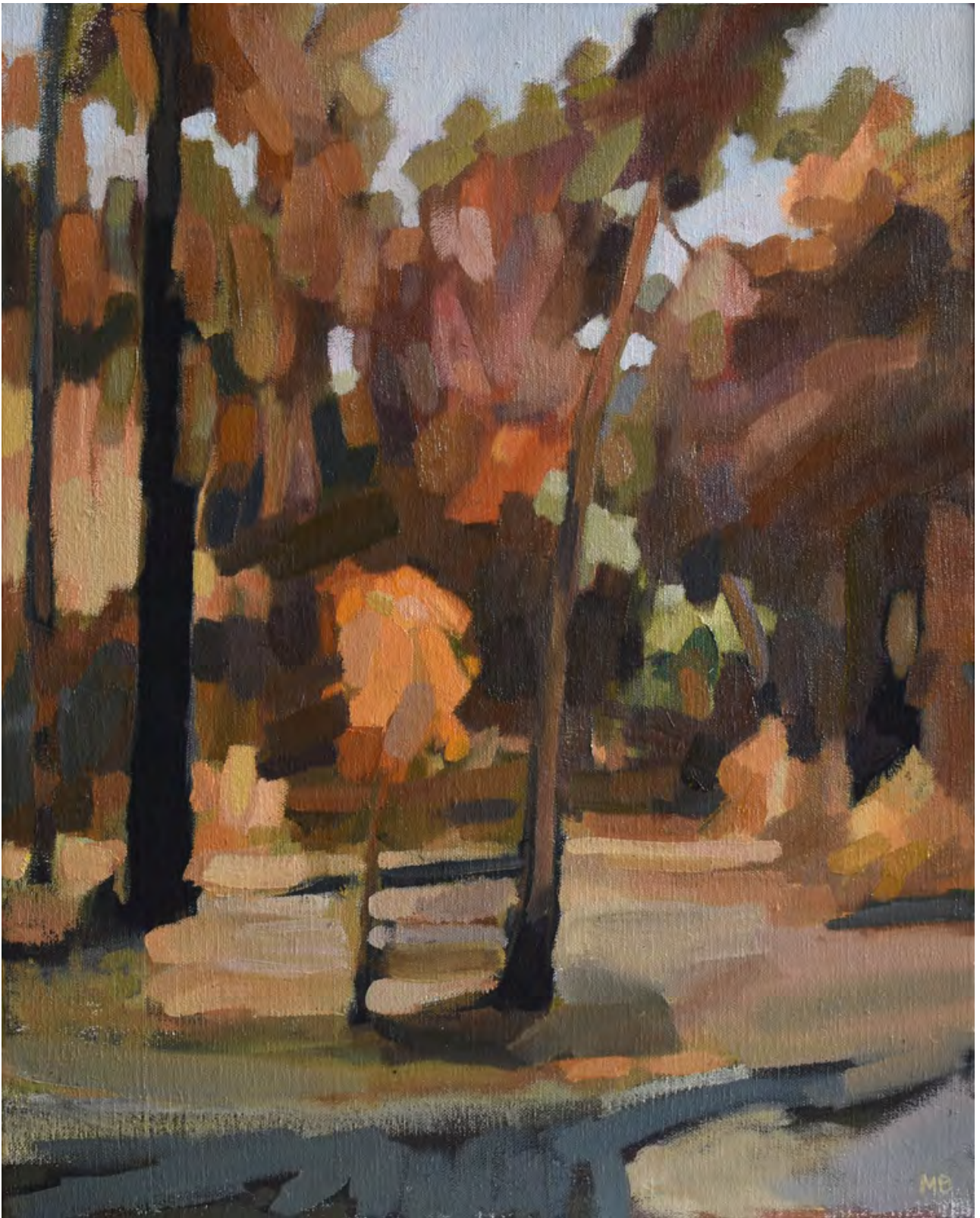
Late Burn , 2021 Oil on canvas 50 x 40cm $ 1,100