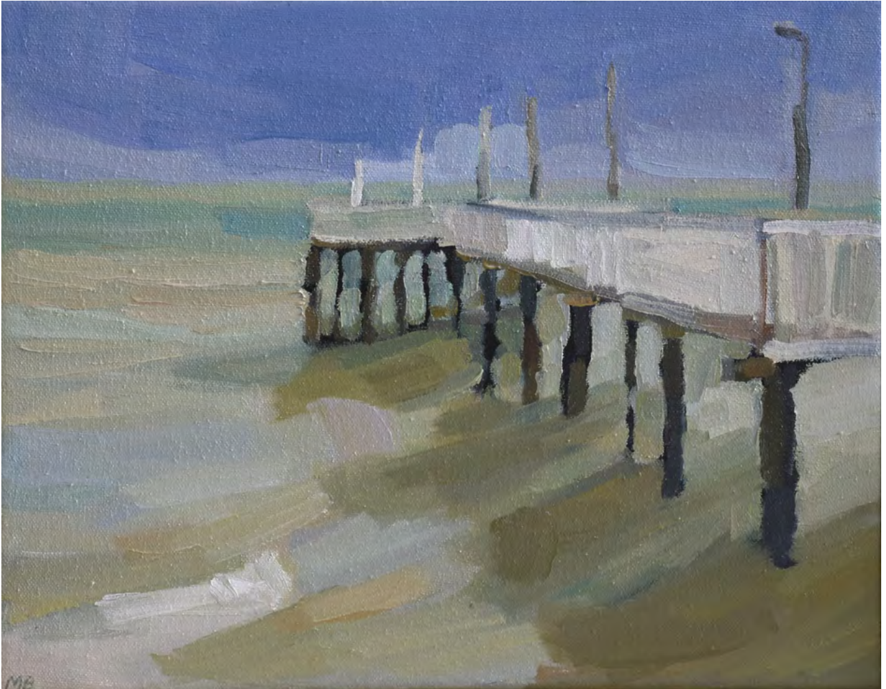
Xris Xross Season Change, 2021 Oil on canvas 28 x 35.5cm $ 900