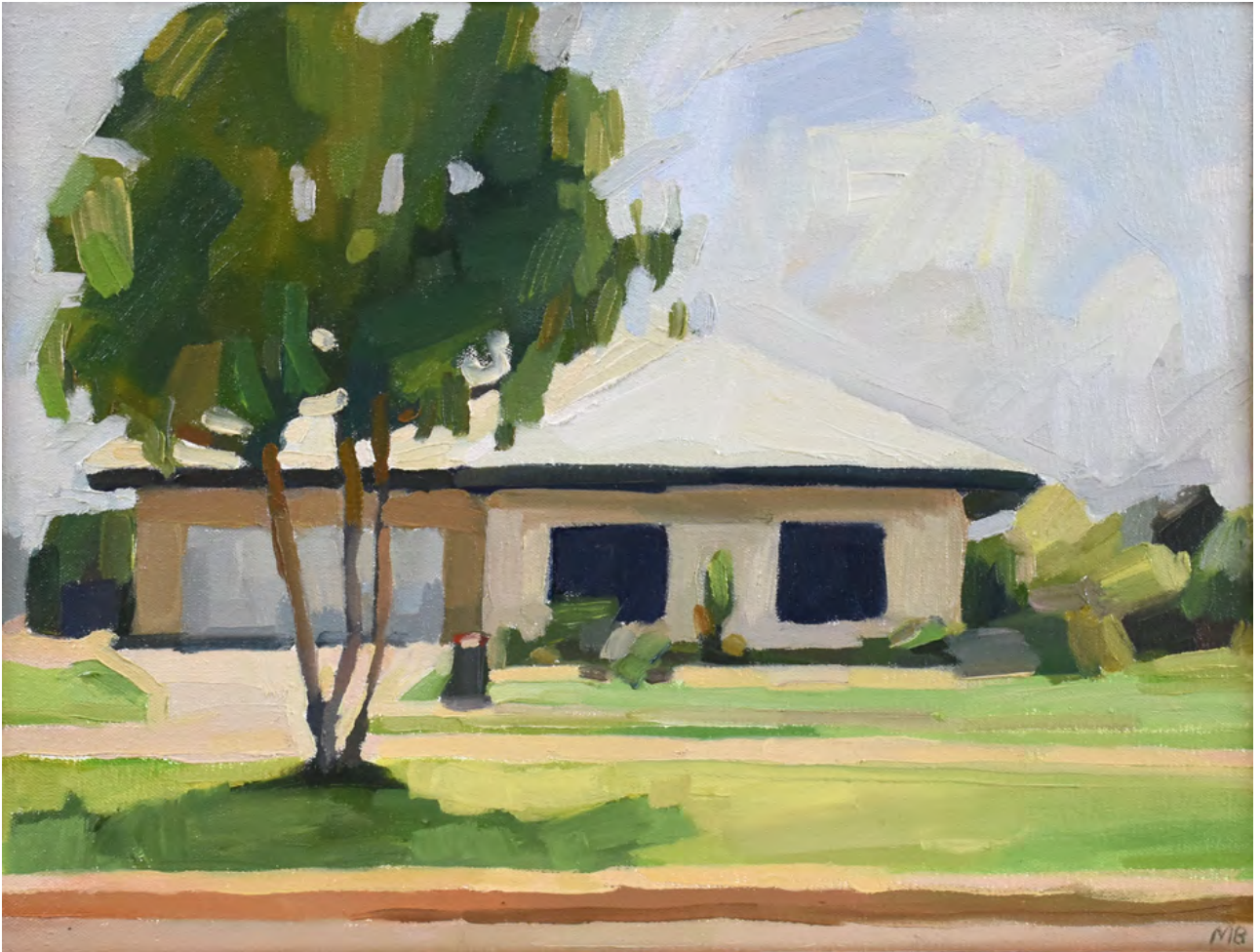
Watching Channel 10 , 2021 Oil on canvas 30.5 x 40.5cm $ 900