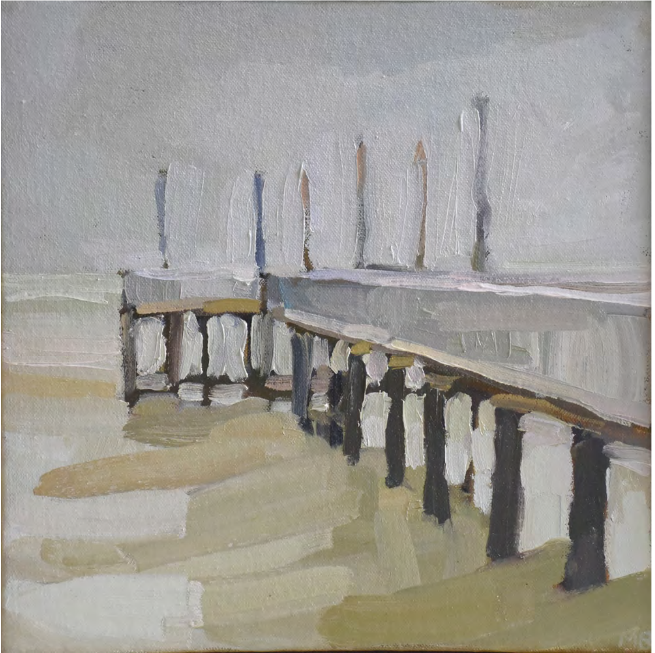
Rolling , 2021 Oil on canvas 25.5 x 25.5cm $ 800