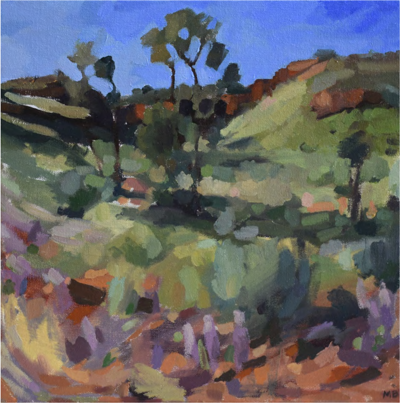
Kathleen Springs, 2021 Oil on canvas 30.5 x 30.5cm $ 800