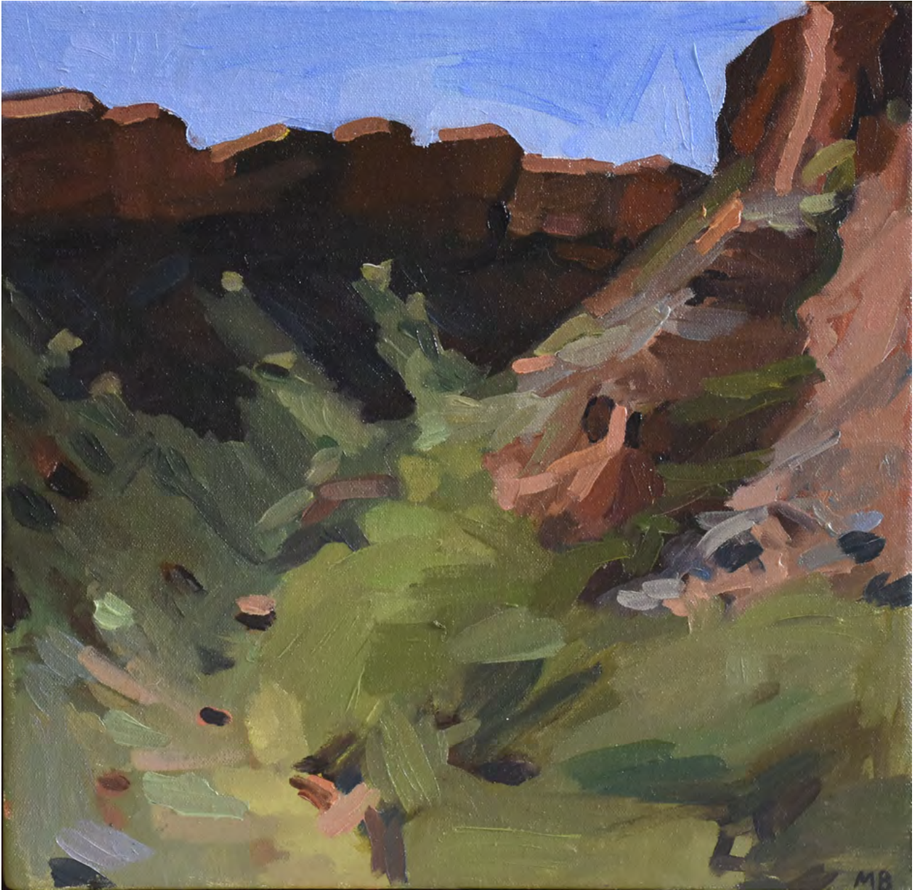
Kings Canyon, 2021 Oil on canvas 30.5 x 31cm $ 800