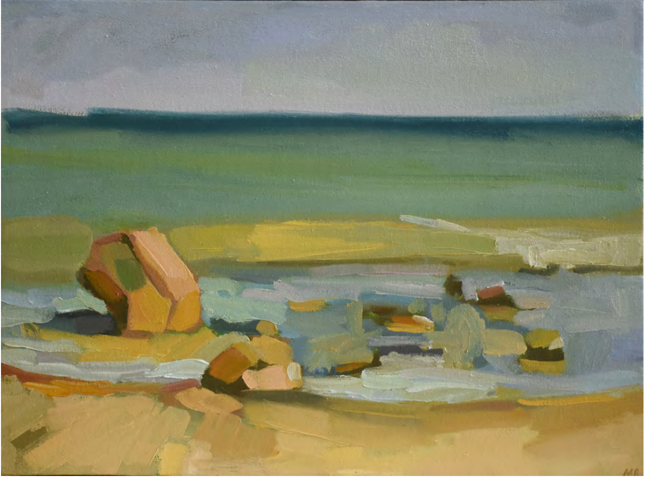
Tides of Gold , 2021 Oil on canvas 30.5 x 41cm $ 900