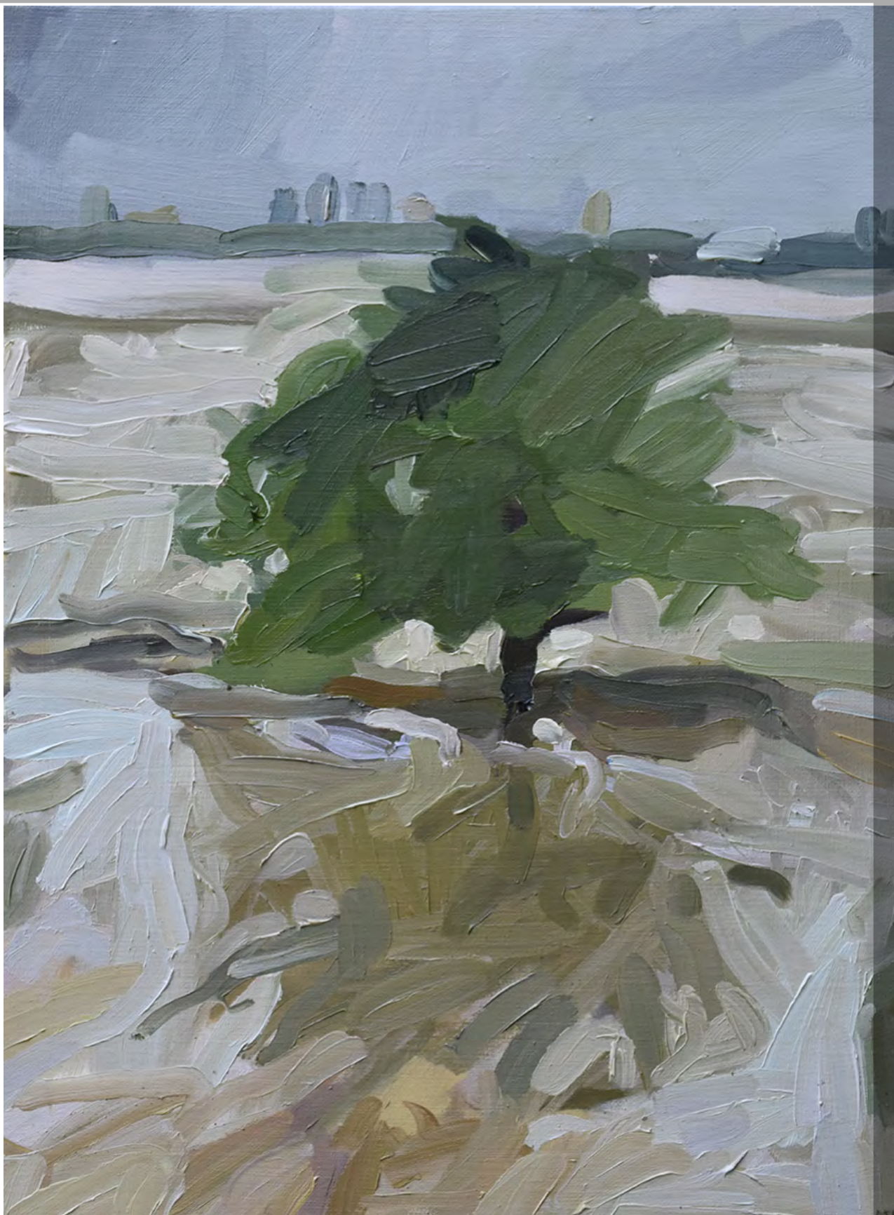
MAX BOWDEN Only the monster's tail, 2022 40 x 30 cm oil on canvas