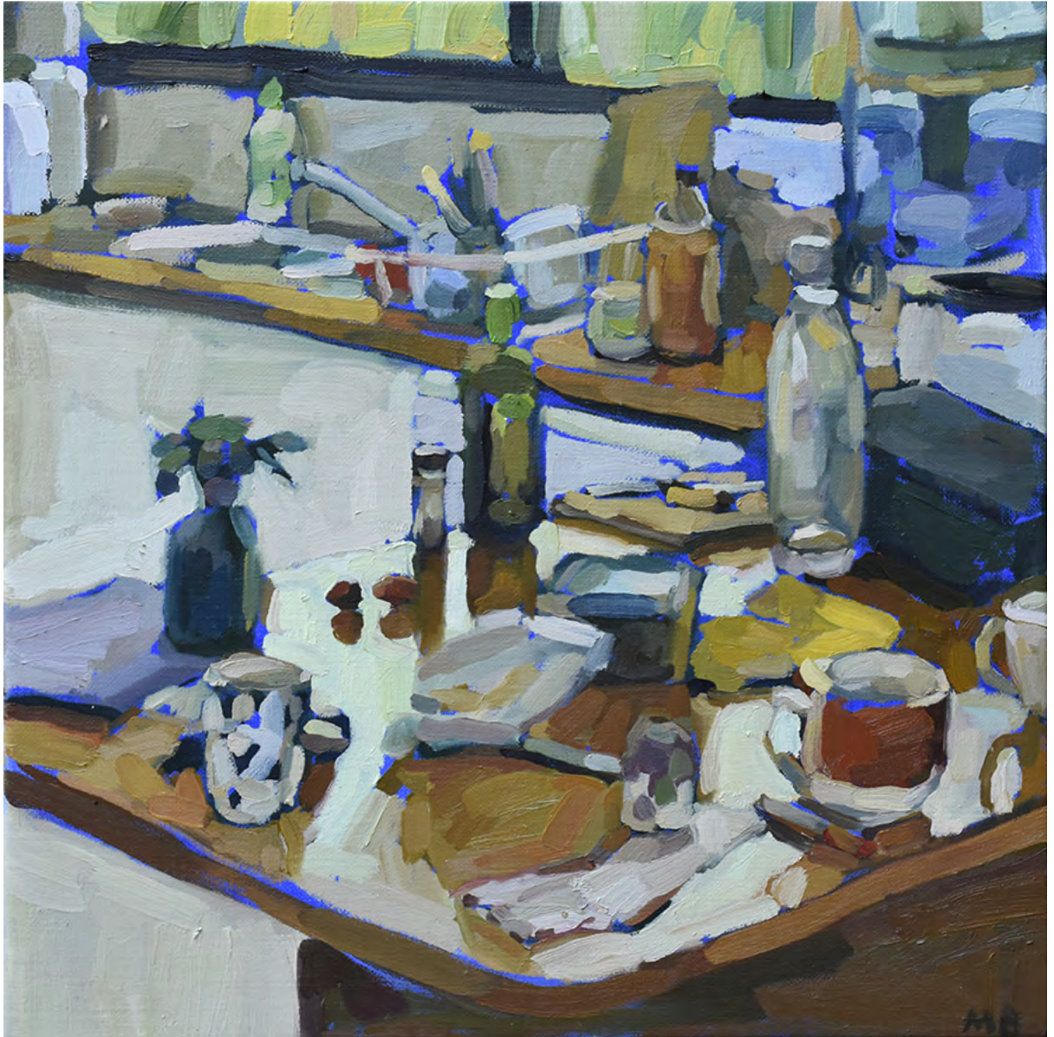
MAX BOWDEN Mother's Day, 2022 30 x 30 cm oil on linen