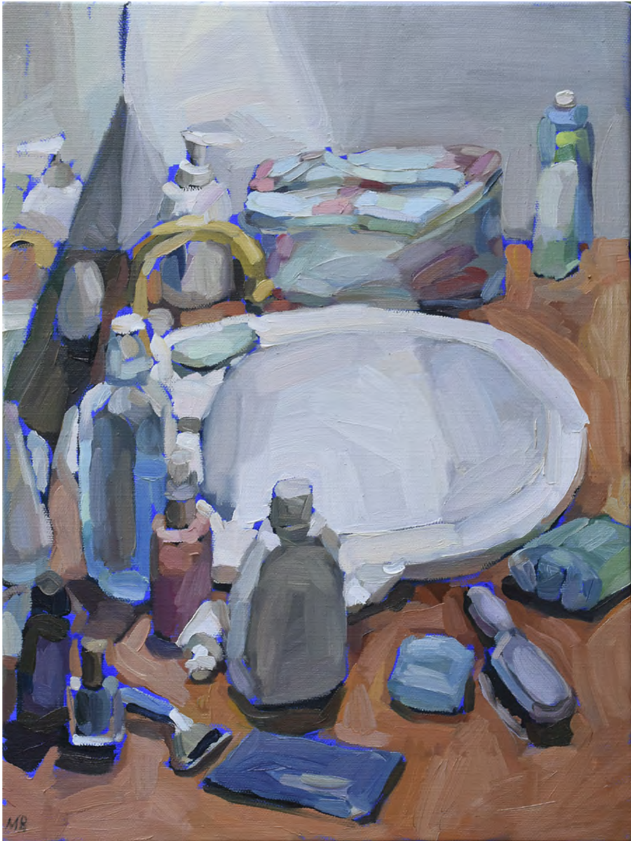
MAX BOWDEN The bower, 2022 40 x 30 cm oil on linen