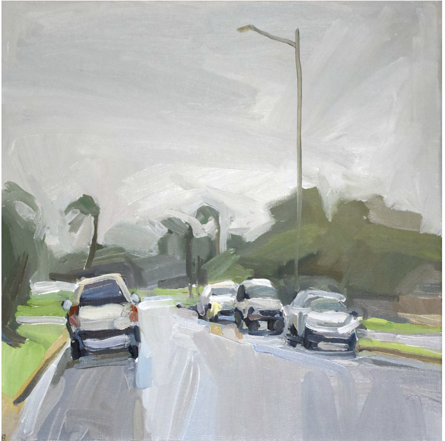
MAX BOWDEN The only surf day in Darwin, 2022 30 x 30 cm oil on Belgian linen