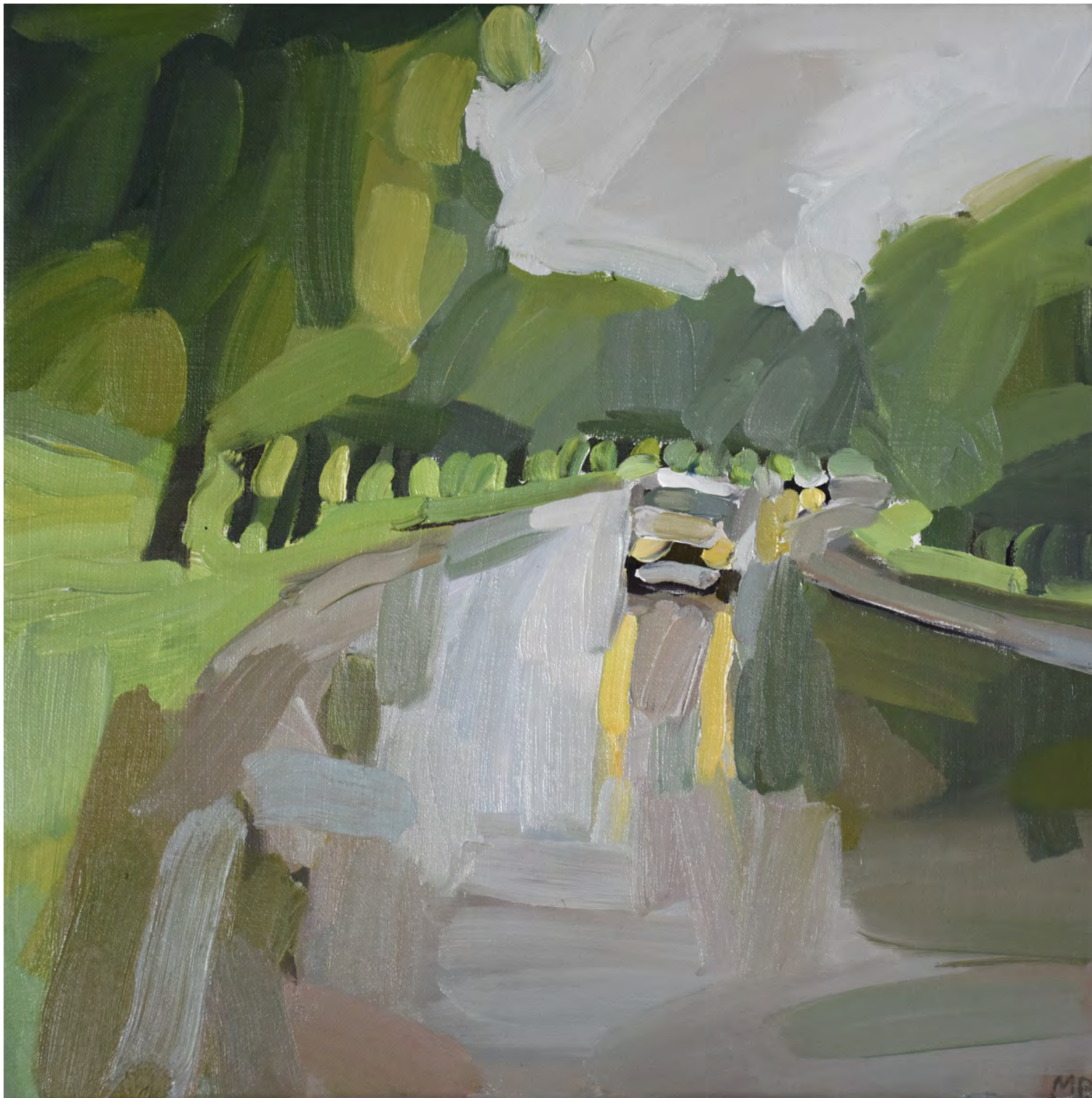
MAX BOWDEN The curly bit, 2022 30 x 30 cm oil on Belgian linen