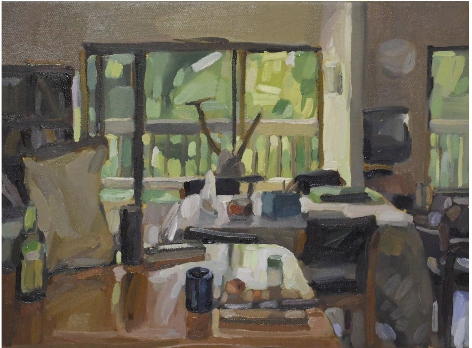
MAX BOWDEN Myth, 2022 30 x 40 cm oil on Belgian linen