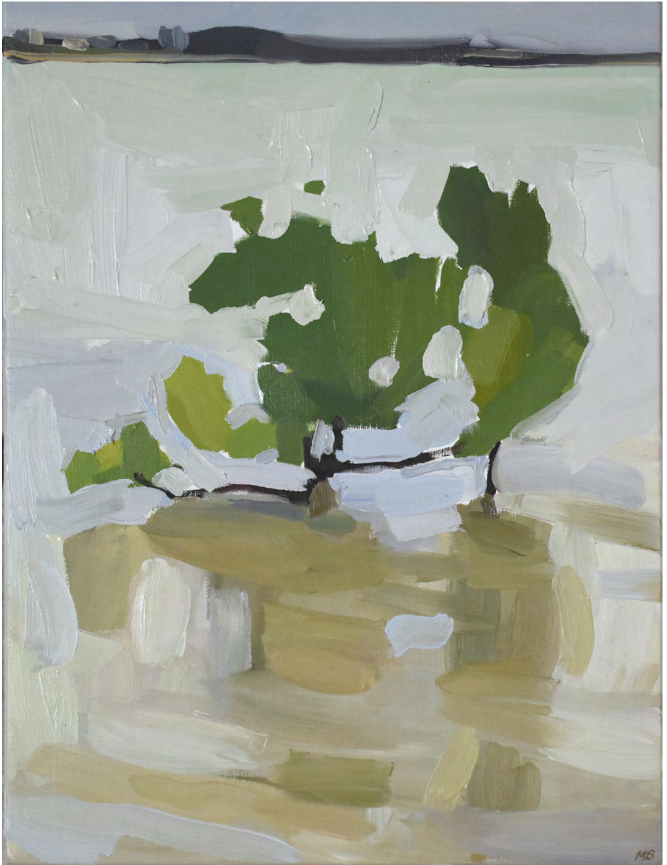
MAX BOWDEN Rising tide lifts all boats, 2022 40 x 30 cm oil on Belgian linen