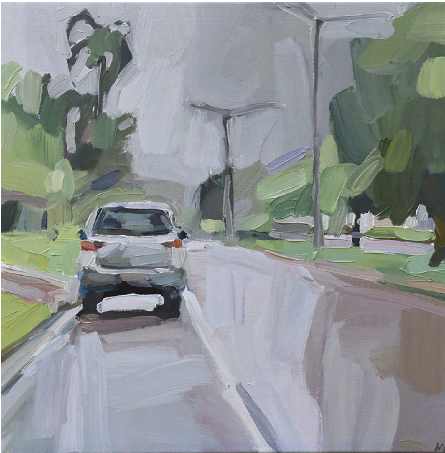
MAX BOWDEN According to my spouse, 2022 30 x 30 cm oil on Belgian linen