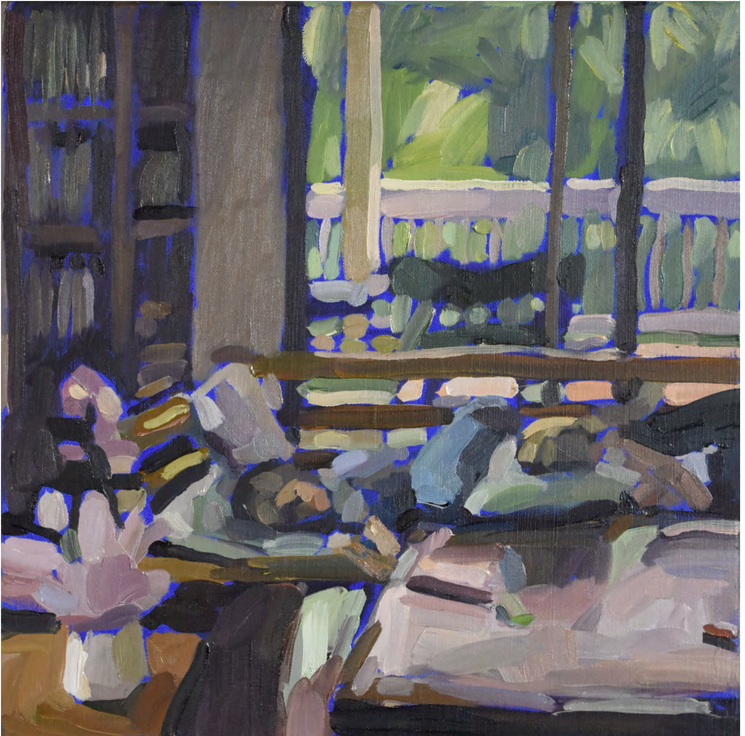
MAX BOWDEN Boys and Flowers, 2022 30 x 30 cm oil on Belgian linen