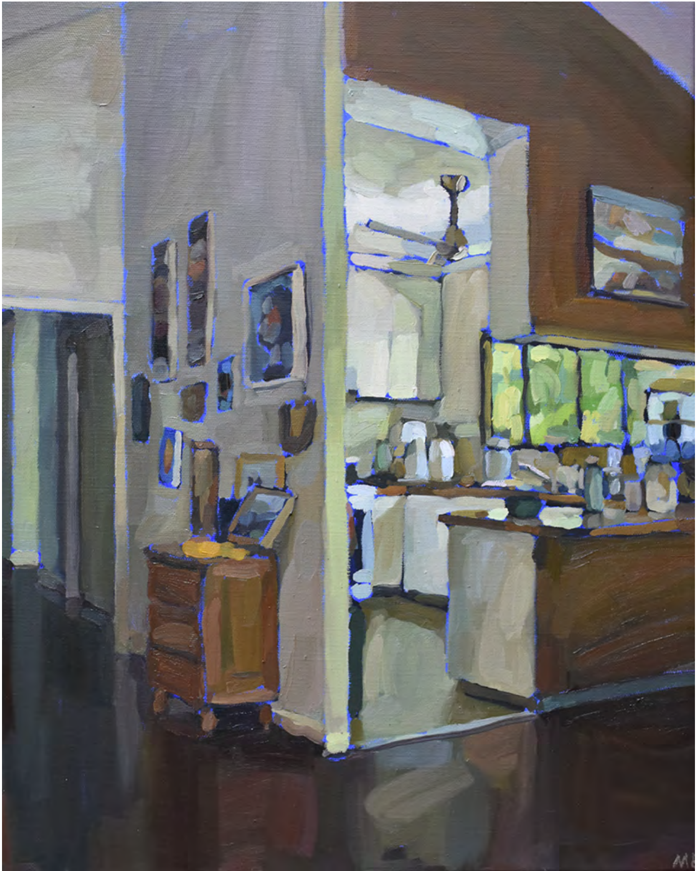
MAX BOWDEN Everything and nothing all at once and never, 2022 50 x 40cm oil on linen