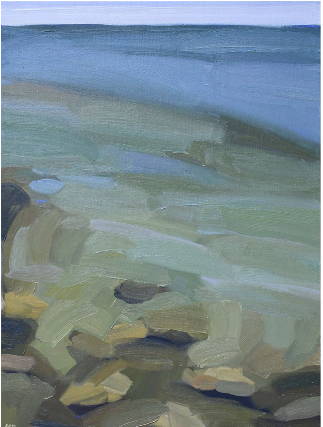
MAX BOWDEN Places, 2022 40 x 30 cm oil on linen