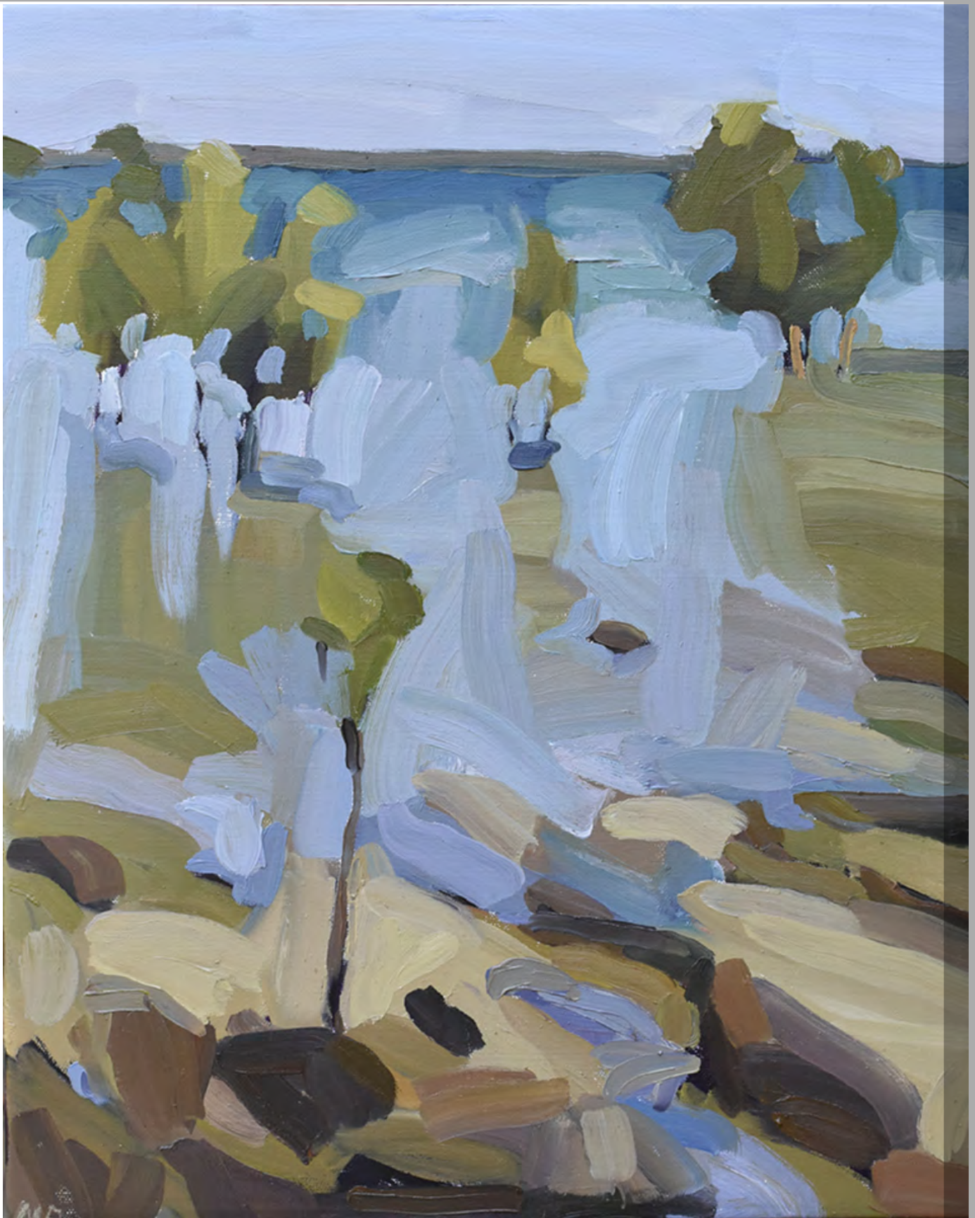
MAX BOWDEN George said the sea was angry, 2022 50 x 40 cm oil on linen