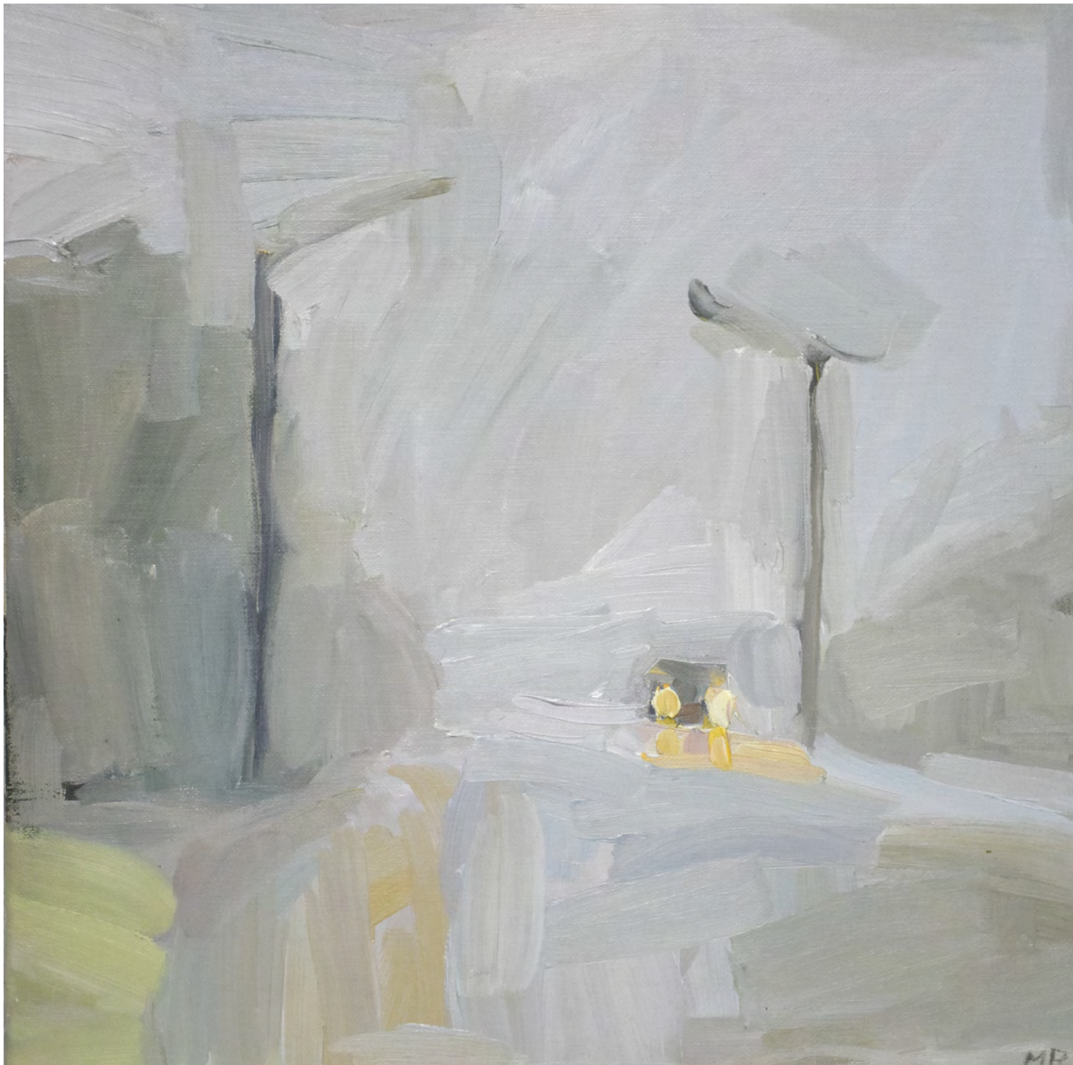
MAX BOWDEN The barracks, 2022 30 x 30 cm oil on Belgian linen