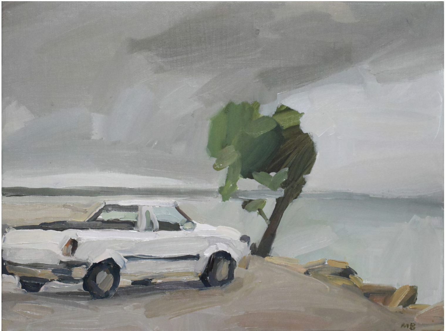
MAX BOWDEN Salt dog, 2022 30 x 40 cm oil on Belgian linen