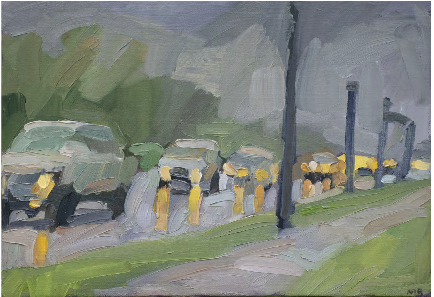
MAX BOWDEN Phone, coffee, wheel time, 2022 21 x 30cm oil on canvas