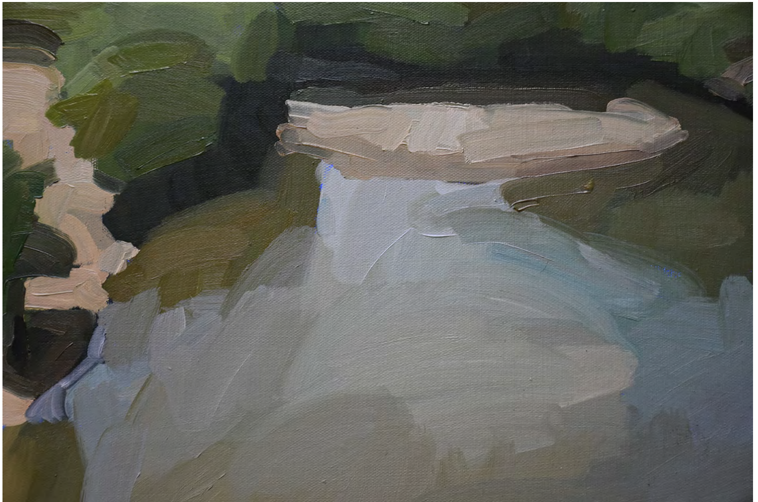
MAX BOWDEN Take a seat over there mind!, 2022 30 x 40 cm oil on canvas