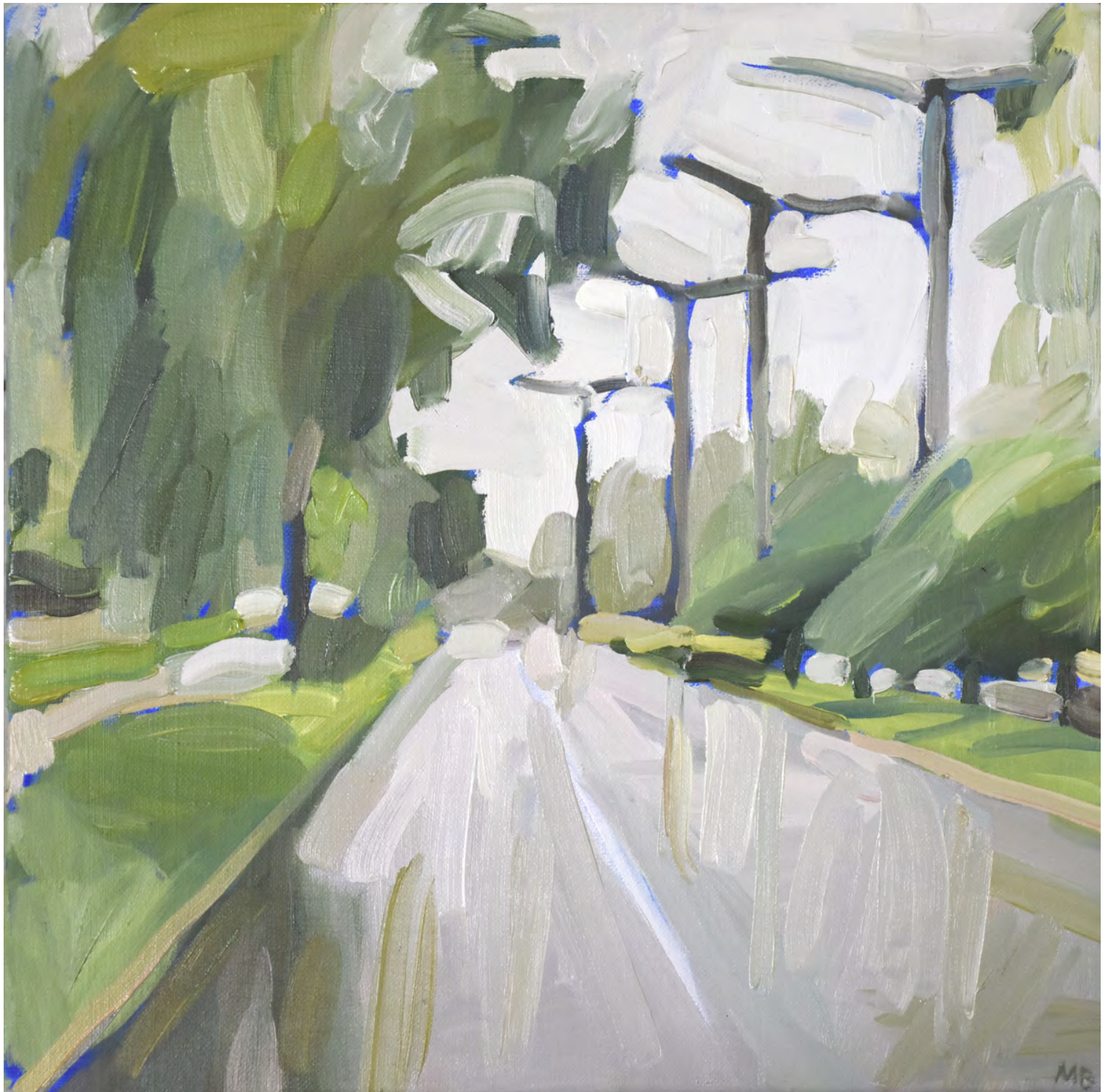
MAX BOWDEN Shifting over us, 2022 30 x 30 cm oil on Belgian linen