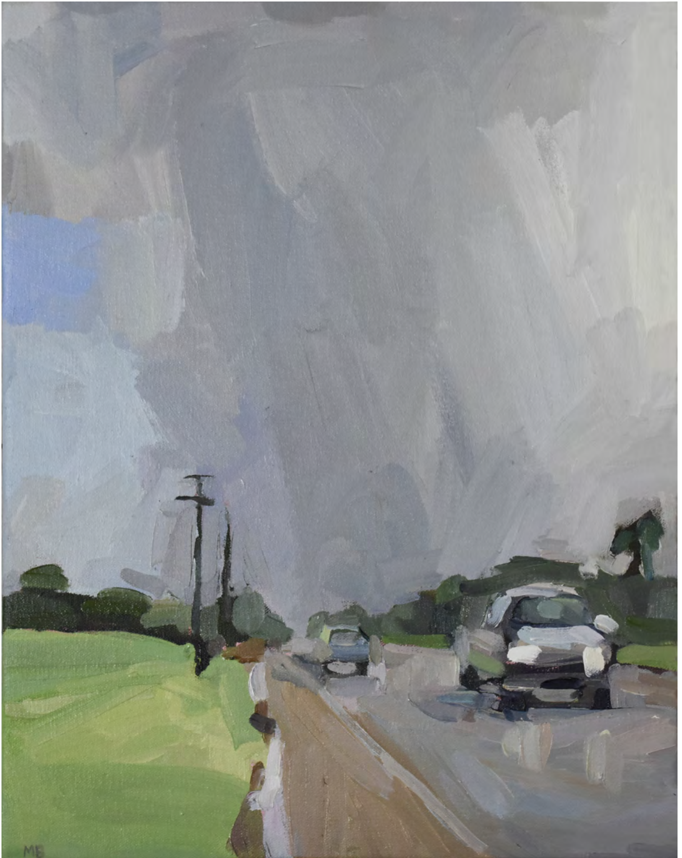
MAX BOWDEN Waving from another world, 2022 40 x 30 cm oil on canvas