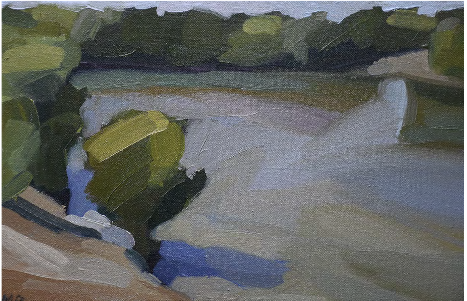
MAX BOWDEN G&T on the bridge, 2022 21 x 31 cm oil on canvas