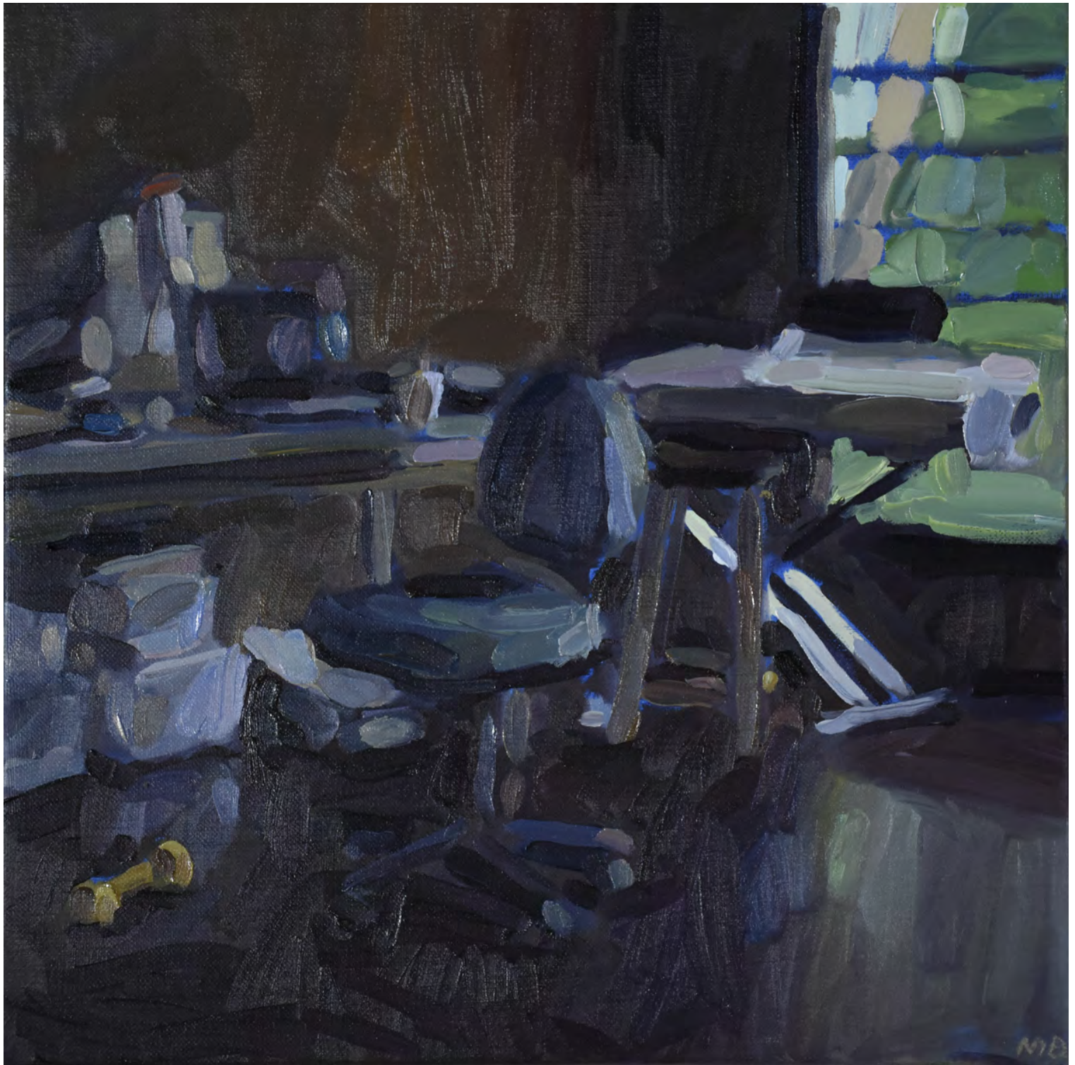
MAX BOWDEN One rep, 2022 30 x 30 cm oil on Belgian linen